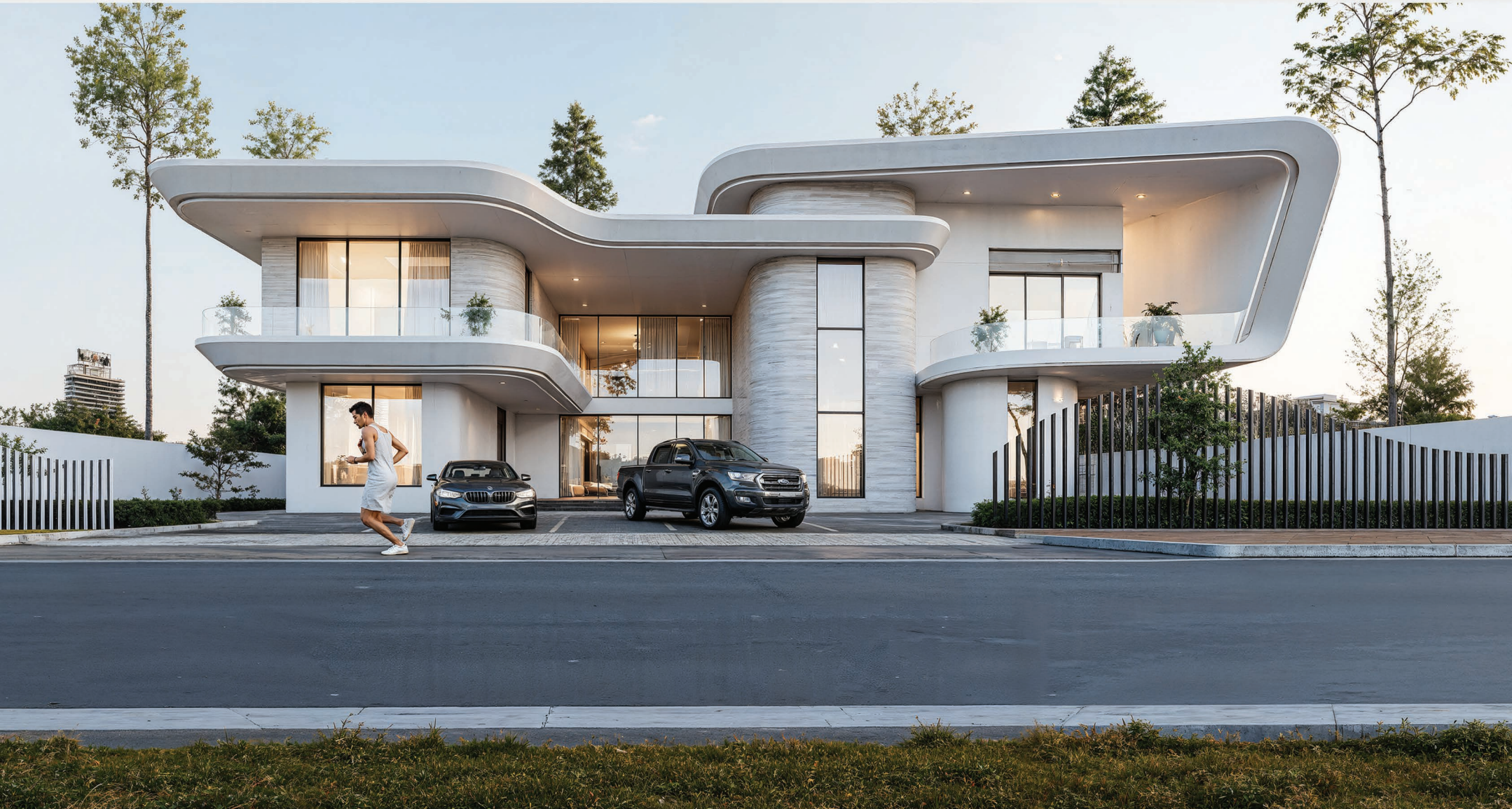
Front View, The Chesna, Katampe, Abuja.