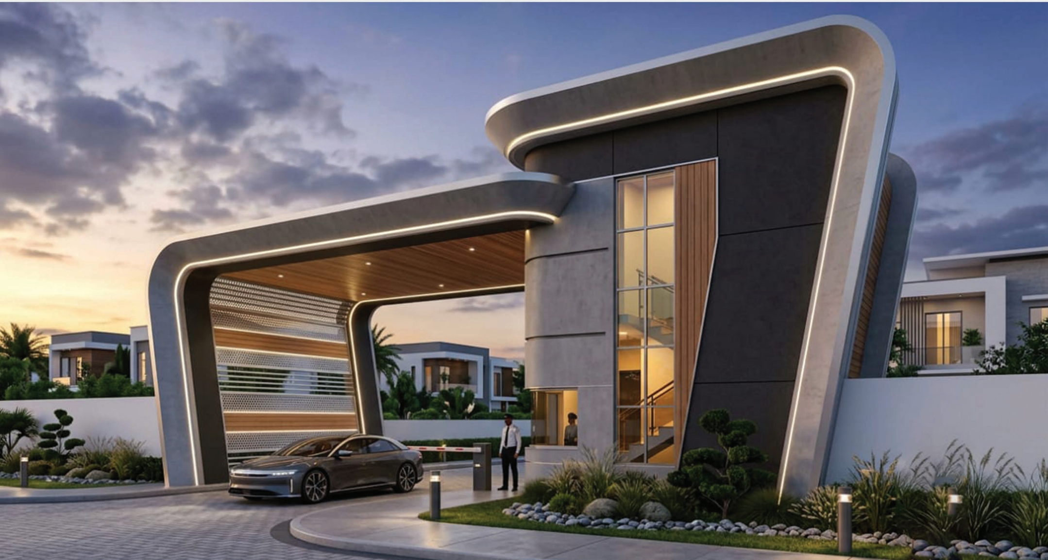
Gate House, The Chesna, Katampe, Abuja.