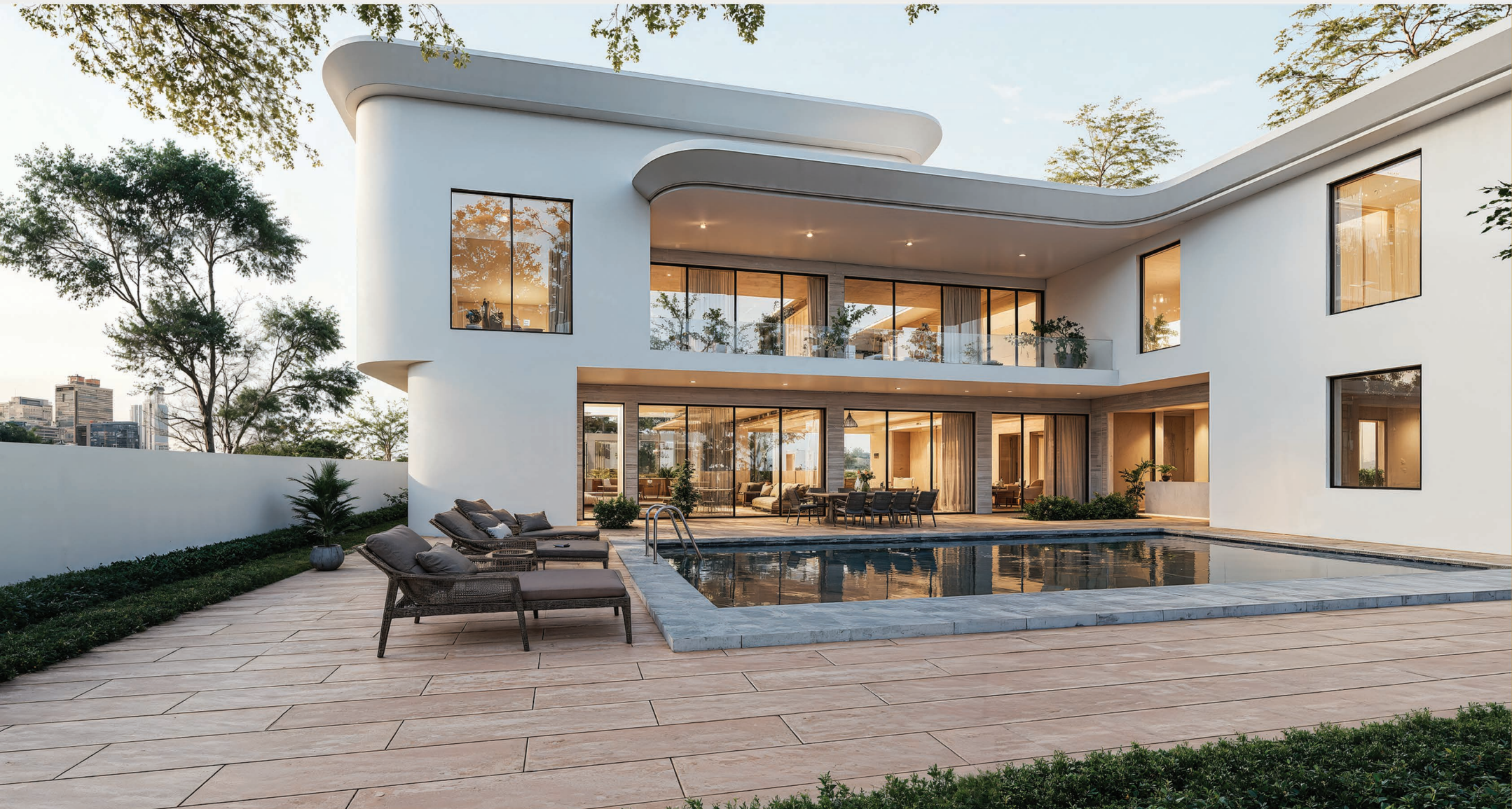
Rear View, The Chesna, Katampe, Abuja.