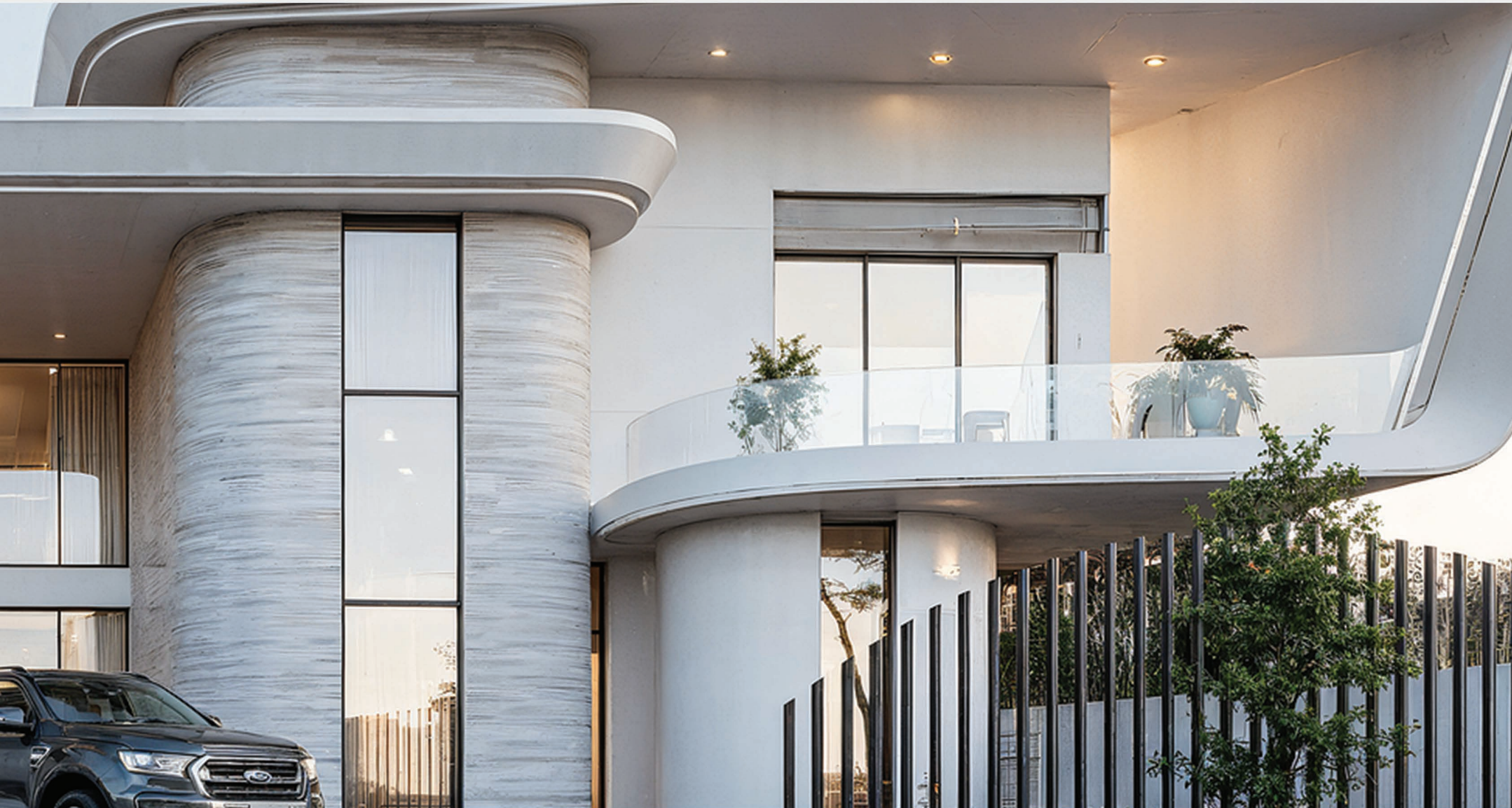
Balcony Zoom In, The Chesna, Katampe, Abuja.